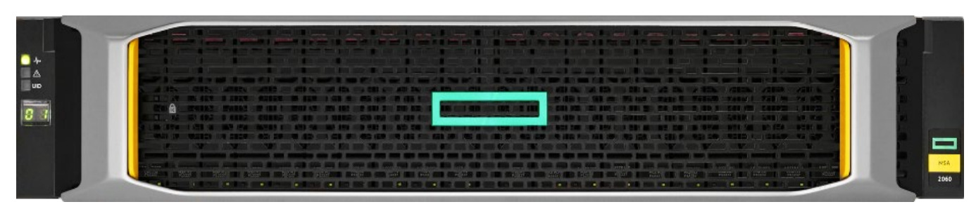
HPE MSA 2060 Storage

The HPE MSA 2060 is a flash-ready hybrid storage system designed to deliver hands-free, affordable application acceleration for small and remote office deployments. Don't let the low cost fool you. It gives you the combination of simplicity, flexibility, and advanced features you may not expect in an entry-priced array. Start small and scale as needed with any combination of solid state drives (SSDs), high-performance Enterprise SAS HDDs, or lower-cost Midline SAS HDDs. With the ability to deliver 325,000 IOPS, the new MSA 2060 is up to 45% faster than its prior generation with ample horsepower for even the most demanding workloads.